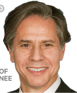
SECRETARY OF STATE NOMINEE ANTONY BLINKEN

"We should absolutely be removing all forms of support for the continuing hostilities in Yemen ."