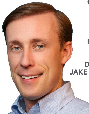
NATIONAL SECURITY ADVISOR DESIGNATE JAKE SULLIVAN

— REMARKS ON "SKULLDUGGERY" PODCAST , SEPTEMBER 2020