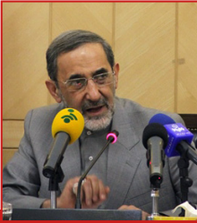
ALI AKBAR VELAYATI